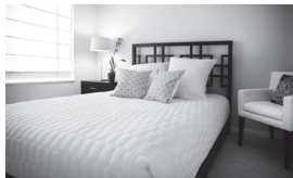
4 b _ _ d