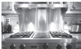
10 c _ _ _ k _ _ r