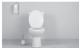
11 t _ _ _ l _ _ t

2 Tick (✓) or cross (X) the furniture for each room.