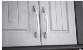
1 c _ _ p b _ _ _ r d