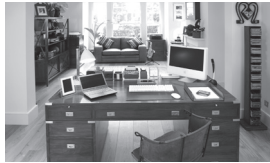
d _ e _ s k